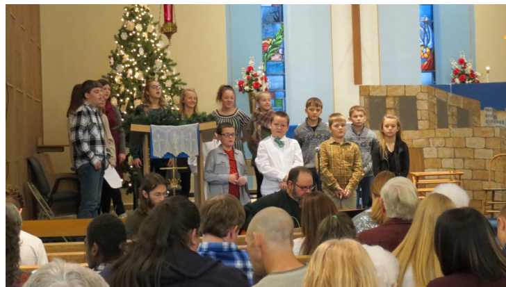
Participants in Children's Christmas Program below